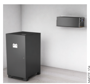
Wall-mounted Zero floor space