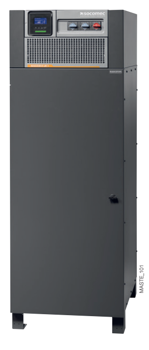
Example of top-mounted installation