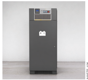
Top-mounted Easy built-in solution