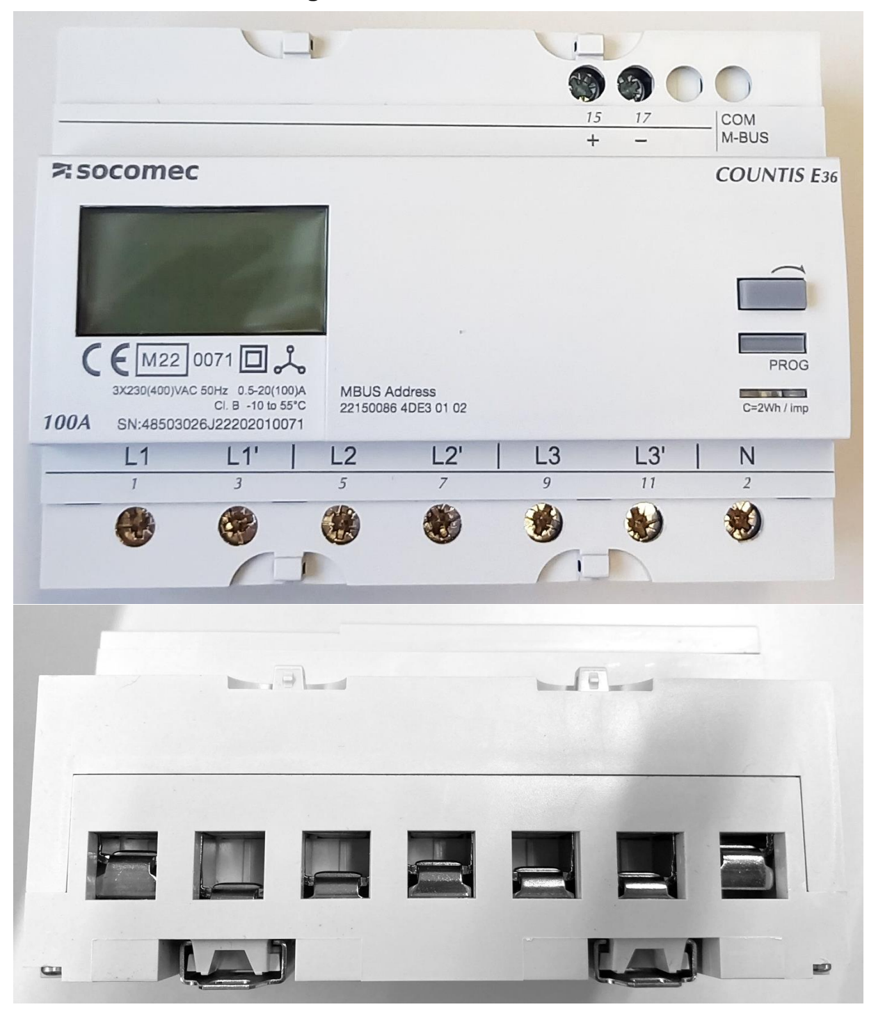
Figure 1– Front and side view of Countis E36 (not secured)