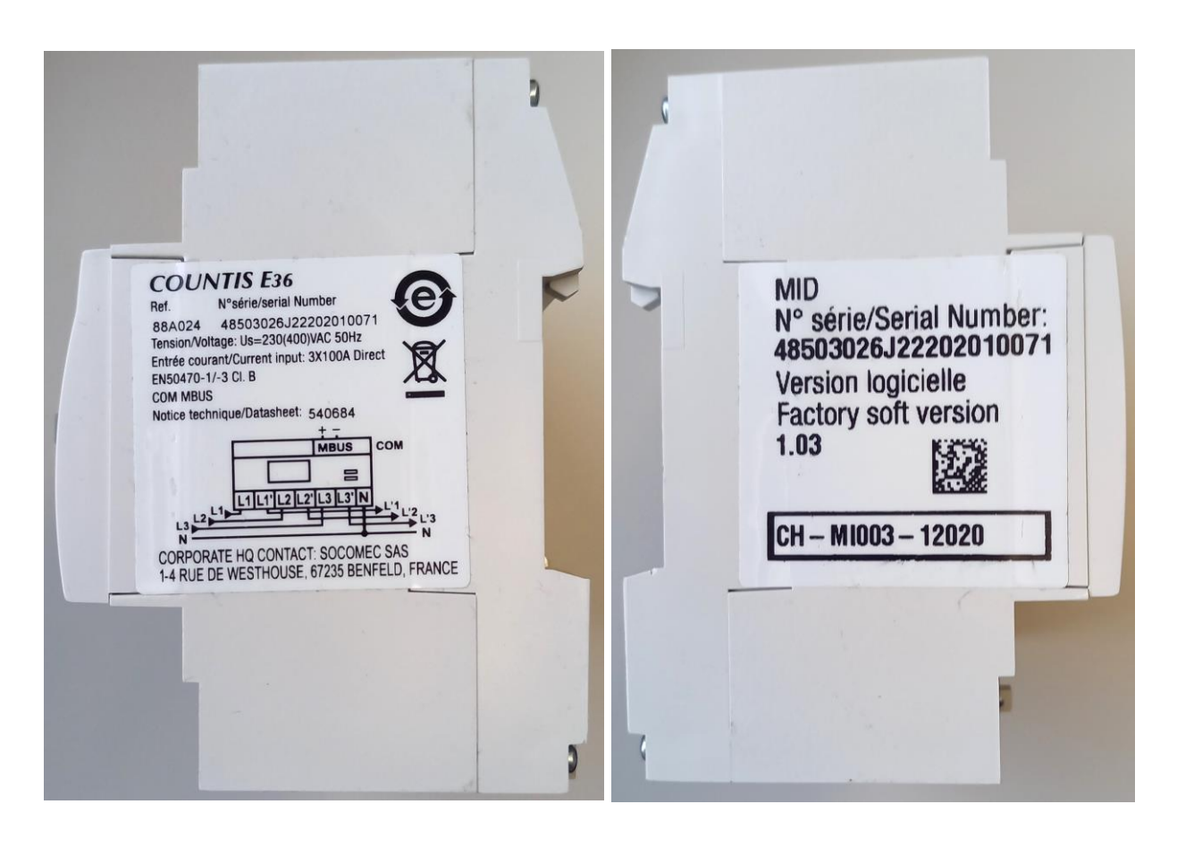
Figure 2 – Examples of type plates (on both sides)