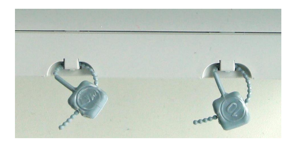
Figure 4 - Meter protection after installation