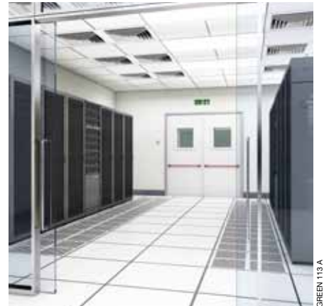
GREEN 113 A